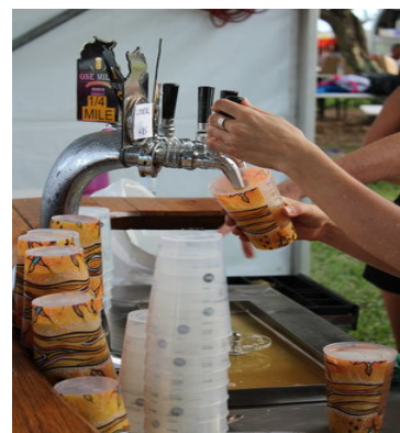
2. Reusable cups