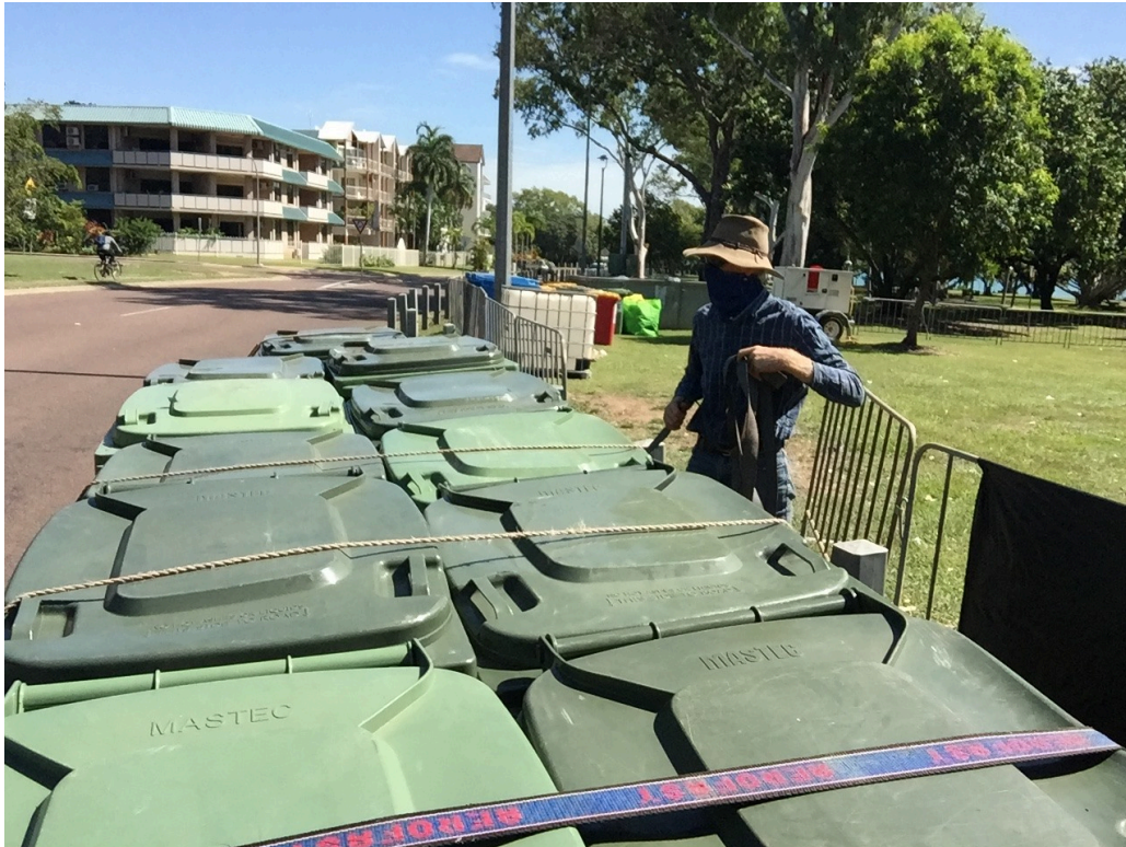
Photo 5. Compost bins ready to be compost by Organic AG.

The data collected suggests that Nightcliff Seabreeze Festival, despite being a larger event in 2019, is successfully reducing its waste. For the third year in a row more material was diverted away from landfill towards the more environmentally sustainable options of reusing, recycling and composting.