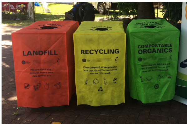
Photo 1. WasteWise Bin Station

Based on the cups that appeared to be returned used, and the cups that did not return, we estimate approximately 4,125 cups were used including both stemless and tumblers.