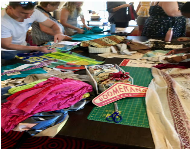
Photo 3. Workshop deliver by boomerang bags

Ripple Effect 2019 introduced a workshop series based around 'hands on' workshops on waste reduction, where the public could learn how to achieve DIY products that will reduce waste production, especially plastic. Interesting talks on sustainability issues were held at the Ripple Effect space on the foreshore and a movie session about waste was presented.