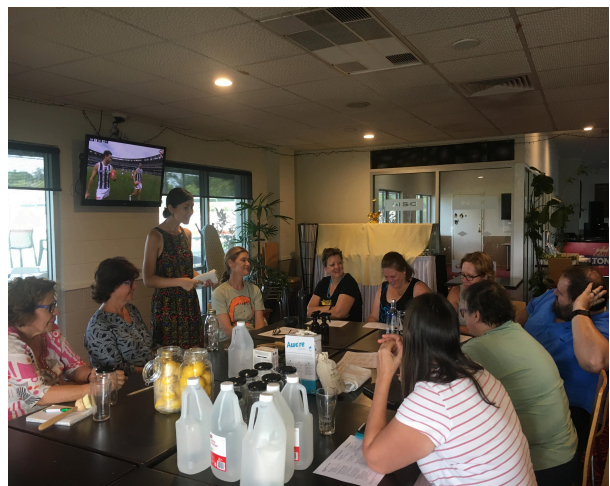
2. WasteFree NT workshop on DIY cleaning products